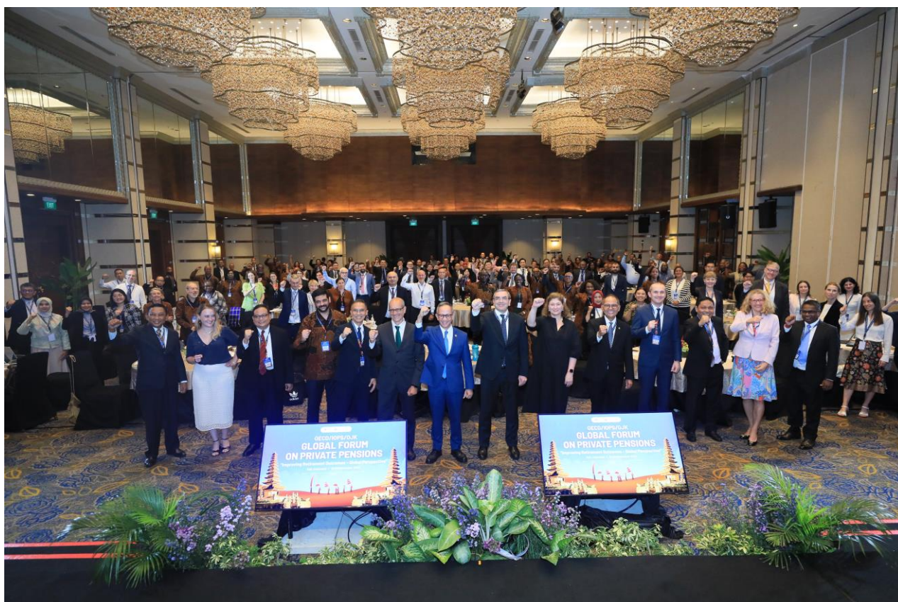
OECD/IOPS/OJK Global Forum on Private Pensions “Improving retirement outcomes – Global perspective”, Bali, Indonesia, 19-20 November 2024.

During the same week, the OECD/IOPS/IPEC Global Forum on Private Pensions took place on 19-20 November 2024 under the theme "Improving retirement outcomes – Global perspective". The major topics of this year's forum included asset-backed pensions in Indonesia – policy and supervisory challenges and solutions; pension funds long-term investment and development of capital markets, asset-backed pensions in Southeast Asia: a discussion on policy and supervisory challenges and solutions; how to combine mandatory and voluntary asset-backed pension arrangements to close the protection gap; digitalisation in pensions as a tool to reach out informal sector; the role of pension funds in the transition towards sustainable finance. The presentations from the forum are available on the IOPS Members' website.