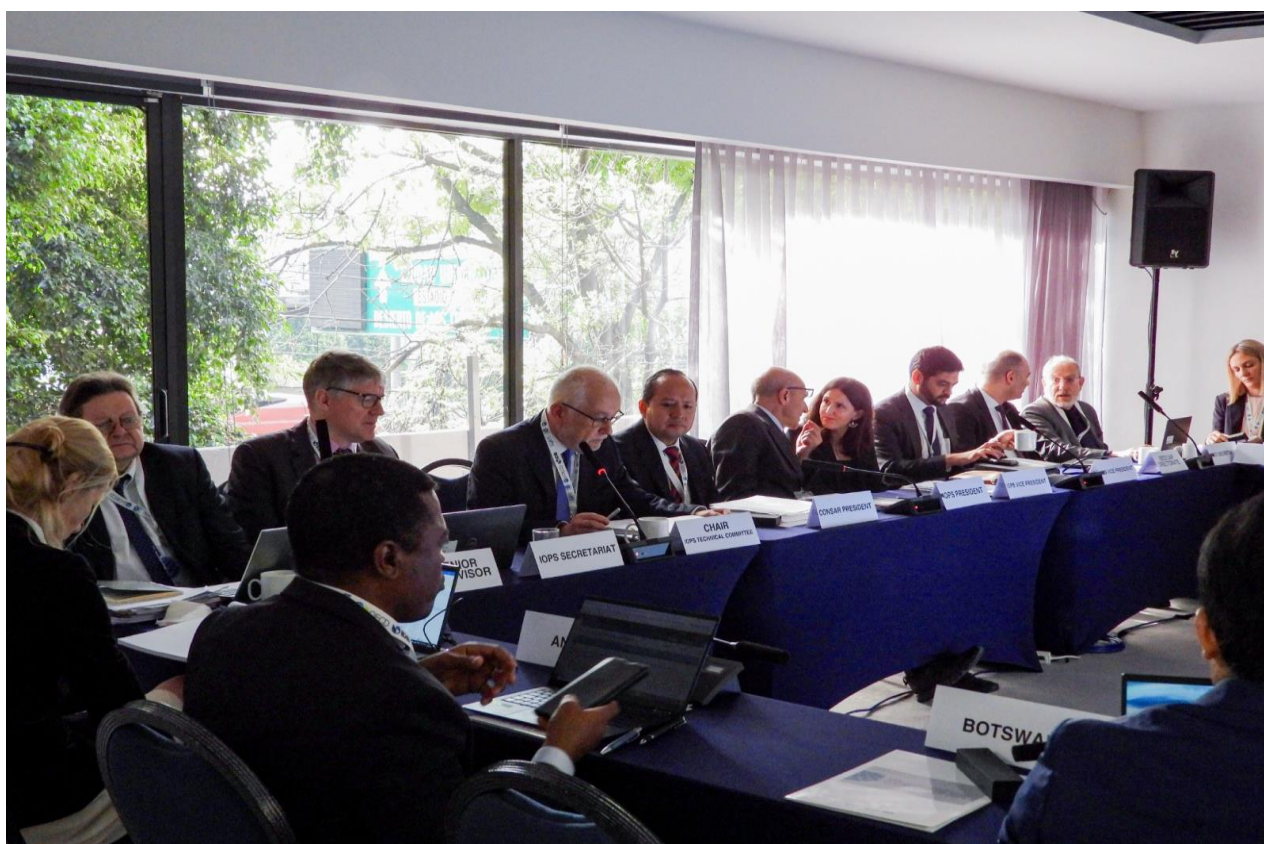
IOPS Technical Committee meeting, Mexico City, 13 February 2024.

The Technical Committee discussed a range of issues in member jurisdictions, such as 1) extending coverage of the New Pension System (NPS) in India, 2) development of the Mexican mandatory private pensions system (SAR) and the key priorities of the Mexican Government and the CONSAR to achieve better results for members in retirement, and 3) development of the legal framework for establishment and management of complementary pension funds in Mozambique and 4) the recent developments in the US private pension market. Members also shared perspectives and their final comments on the project on the supervision of pension investments and on the draft survey on selected infrastructure investment issues. The first draft of revisions of the IOPS Principles were in-depth discussed. Furthermore, valuable insights were exchanged on ongoing projects, including the project on Resilience of pension supervision against shocks (crisis management). Members discussed draft scoping survey and heard the presentation on Hong Kong, China experience, and pursued discussion on the revised implementation note for the ESG guidelines.